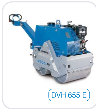
DVH 655 E